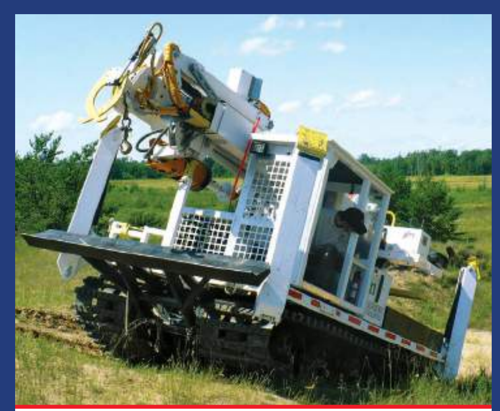
The only derrick on the market that can climb a 40 degree slope with a low center of gravity to provide excellent sideslope stability