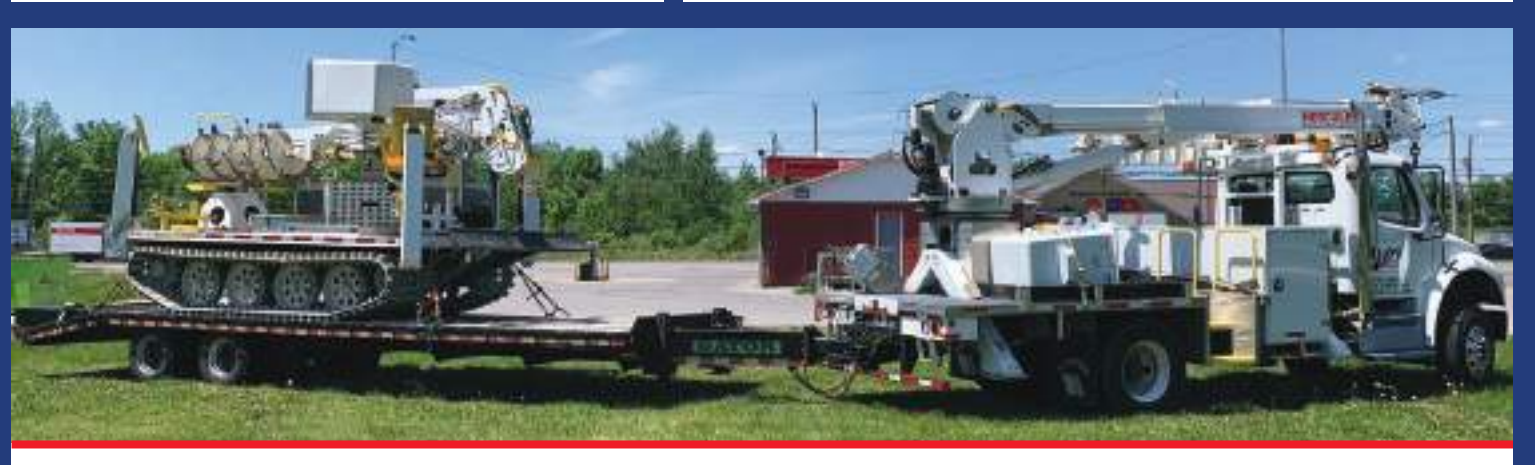
RT-02 DD Tracked Digger Derrick is easily transportable to jobsite on a dual axle trailer behind a single axle bucket truck