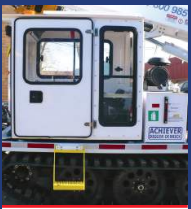
The optional closed cab comes with a front wiper, heater and two opening windows