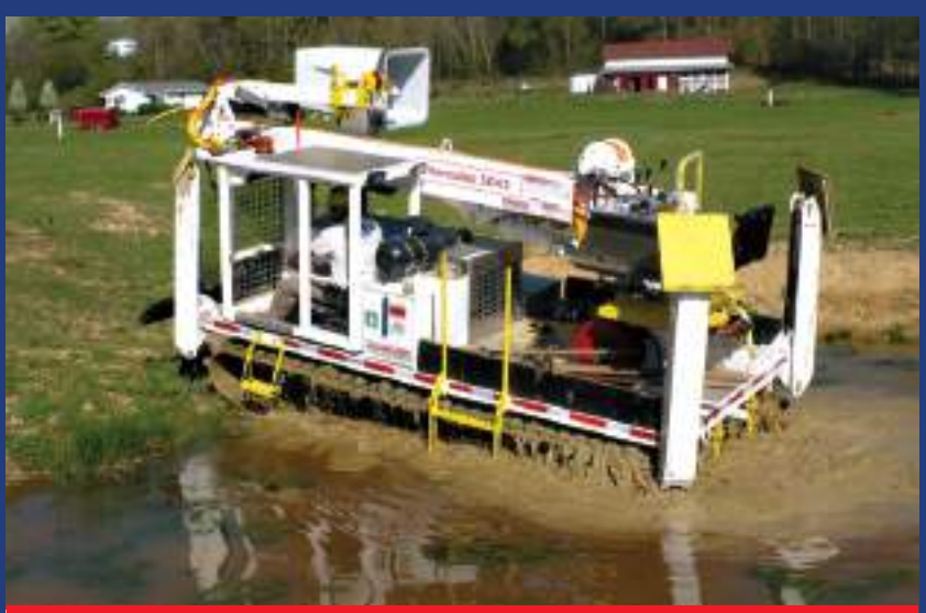
Low ground pressure means excellent flotation on soft ground