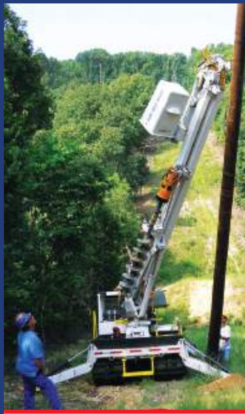
The Achiever can set up to 70' poles