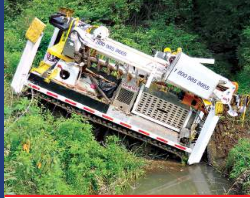
The Achiever's advanced track and suspension design and powerful engine allow it to go almost anywhere