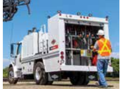
Each SiteStar lube truck is equipped with a full-width rear service compartment for easy, well-lit access to the entire dispensing system.